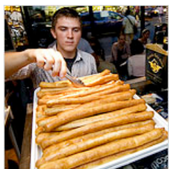
A Menu for the Gluten-Averse