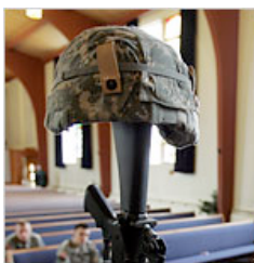
A Plea to Give Each Death Its Due