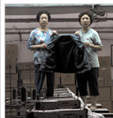
Figures Moving Across a Lawless Island